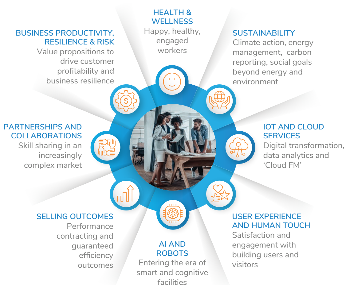
Exhibit 1: Top Transformational Trends in FM and Buildings

The pandemic has created new or heightened use cases for solutions or innovations that address these trends; for example, one of the fastest-growing areas in the global market in 2020 was cloud-based analytics and remote monitoring and management of building assets such as HVAC and refrigeration. The focus on digital transformation has continued its climb up the list of priorities in 2021 as suppliers have the opportunity to bring technology to life and deliver integrated solutions that focus on both people-centric outcomes and asset-centric solutions including maintenance management, energy efficiency, renewable energy integration and optimisation of building technologies.